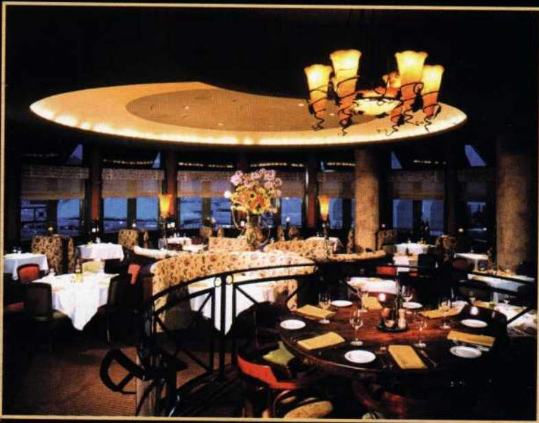
Napa Valley Grille Page 39